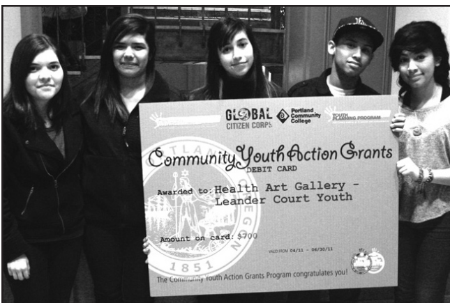
ROSE youth accept the grant award, which will help further their health advocacy efforts