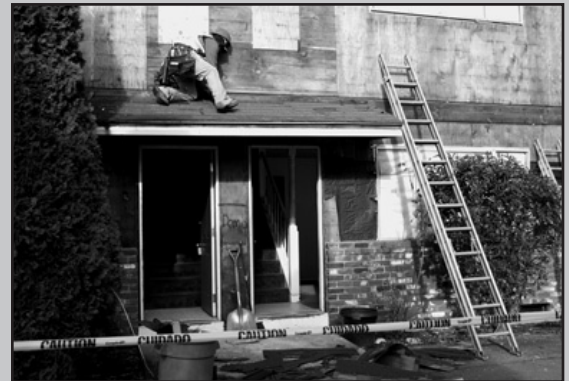
Current rehab work on Bellrose Station in Lents

The Portland Housing Bureau has awarded ROSE funding for six additional properties that will increase our affordable housing production to 404 homes and apartments. The new projects will rehab 19 apartments on SE Raymond Street as well as five homes in Lents for first-time homebuyers. The multi-family project was selected in the Bureau's recent Notice of Funds Availability, which also funded repairs to a property in ROSE's existing portfolio - Beyer Court. The latter property, located across the street from the Wattles Boys and Girls Club, is named after long-time Lents activists and ROSE founders, Jim and Pat Beyer.