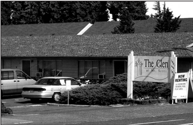
The apartments at The Glen at Mt. Scott need more than just a fresh coat of paint - they need a new name!

With support from the Portland Development Commission and the city's new Housing Bureau , ROSE is halfway through acquisition and rehabilitation of two apartments in the Lents Town Center Urban Renewal Area. ROSE is about to purchase "The Glen at Mt. Scott" - 40 two and three-bedroom apartments on SE 92nd. It will provide great homes for families just two blocks from the Flavel light rail station on the new Green Line.